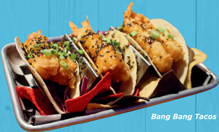
Bang Bang Tacos

shaved pork | grilled pineapple | onion | cilantro | lime juice