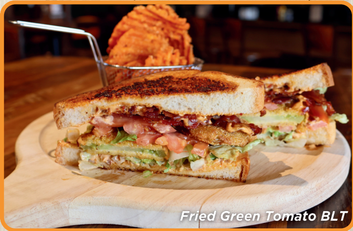
Fried Green Tomato BLT