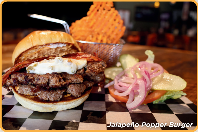
Jalapeño Popper Burger